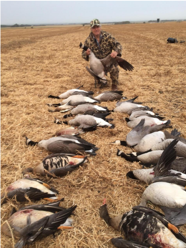
Tom Zenchysen went Goose hunting again this September.